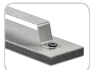
PP GF Foam + PP GF top layer Pull-out force 1,900 N

For more information please contact Niko Müller, phone +49 2751 529-5959, e-mail nmueller@ejot.de