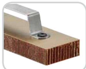
Aramid honeycomb + Aramid fibre top layer Pull-out force 700-1,200 N