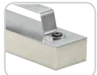
PUR foam + 0.6mm Aluminium AW3003 Pull-out force 800 N