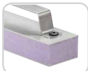
XPS-foam + PS GF top layer Pull-out force 500 N